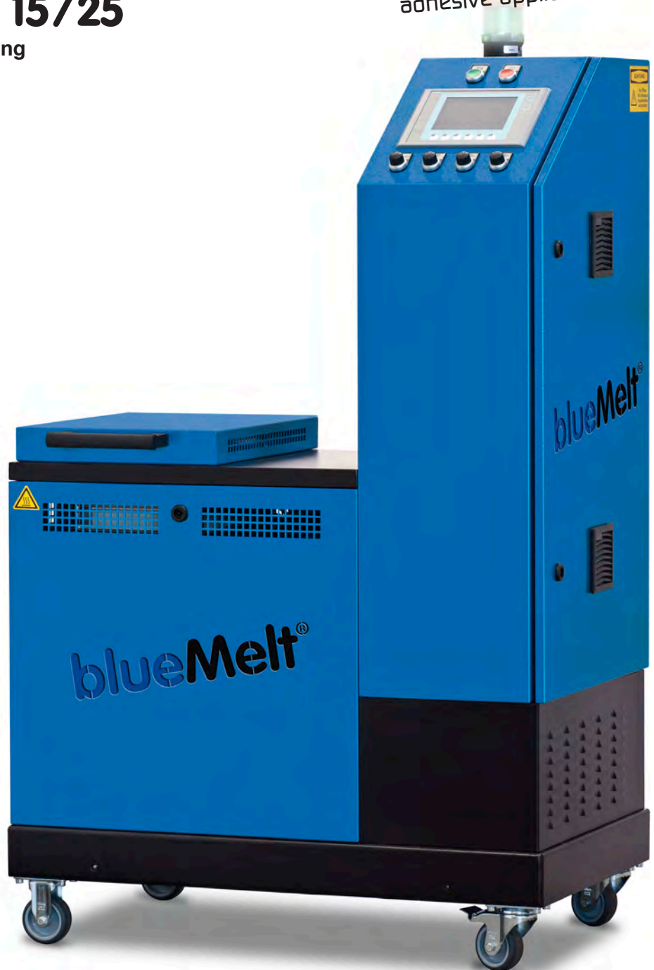
fig. blueTank PUR 15

Compact unit designed for long service life. Low-maintenance design.